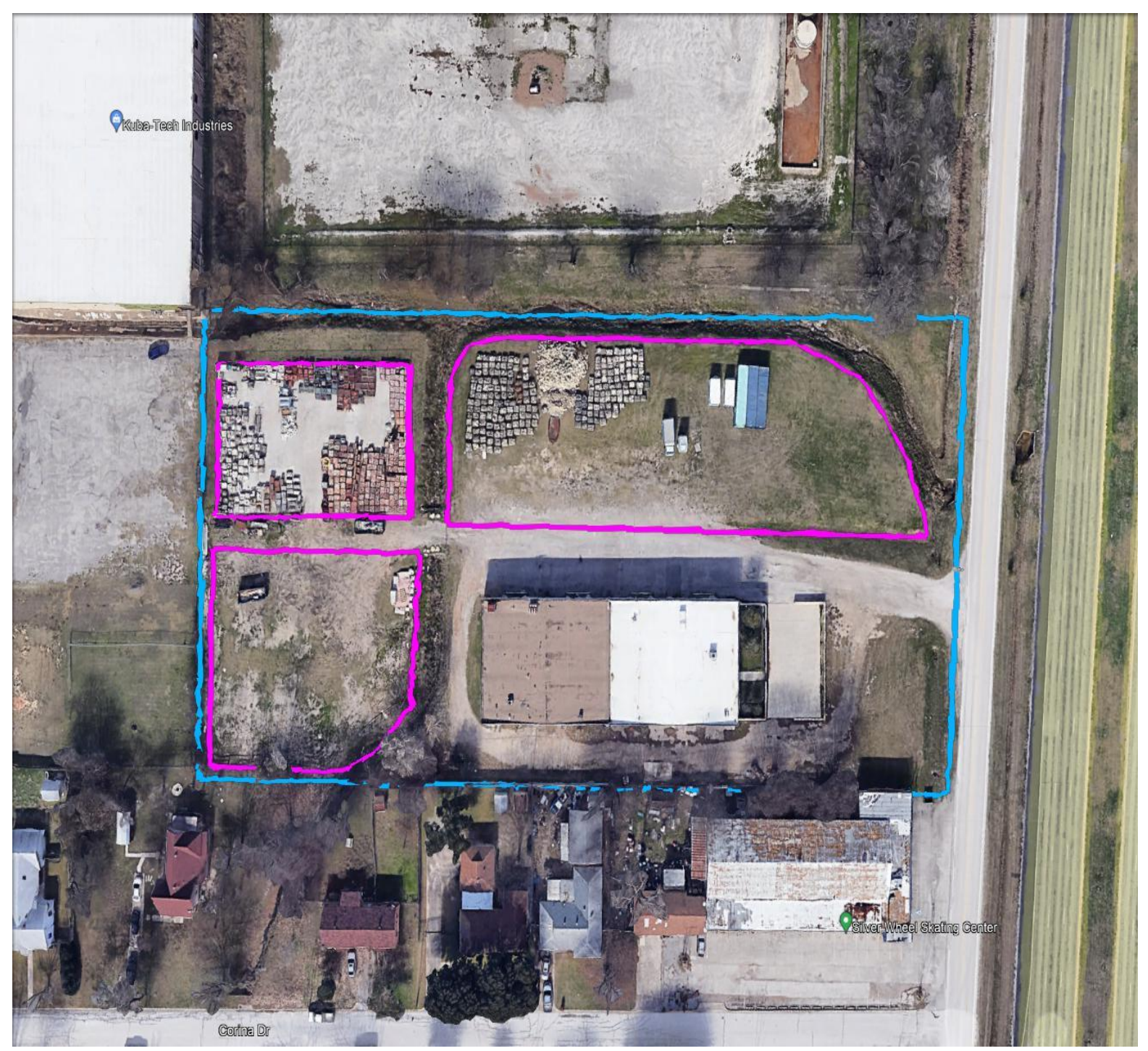
COMMERCIAL REAL ESTATE DEVELOPMENT, INVESTMENT & BROKERAGE